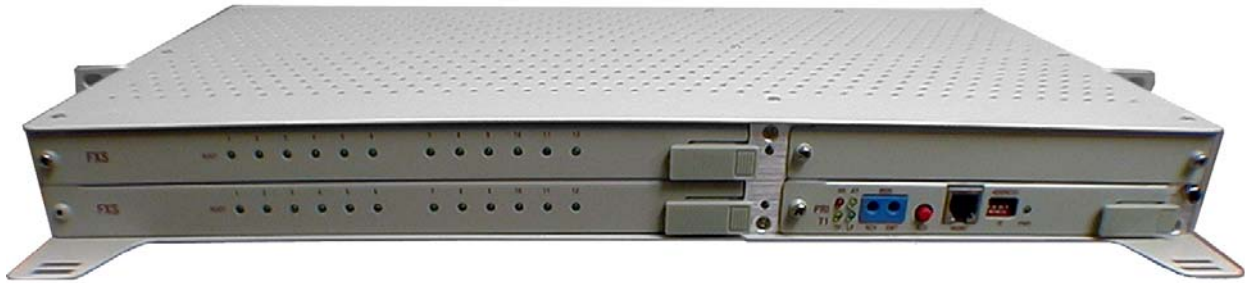
Figure 1: Xedge 1000 DS1/E1 Integrated Access Device